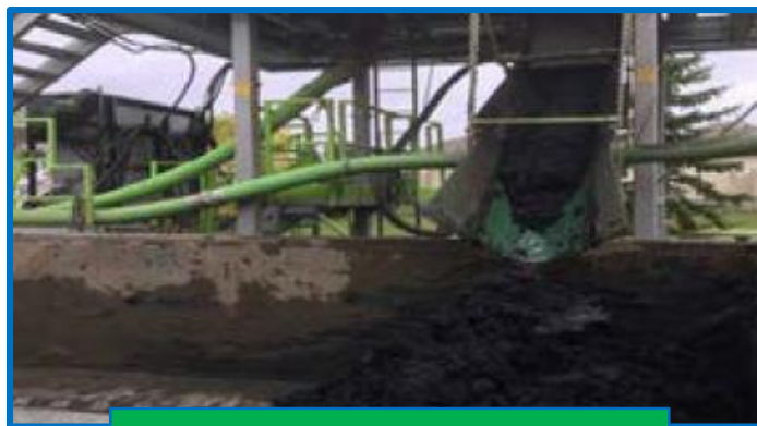
Large project: Using Centrifuge