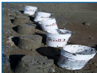
TESTING ON SITE TO VERIFY DOSING RATE