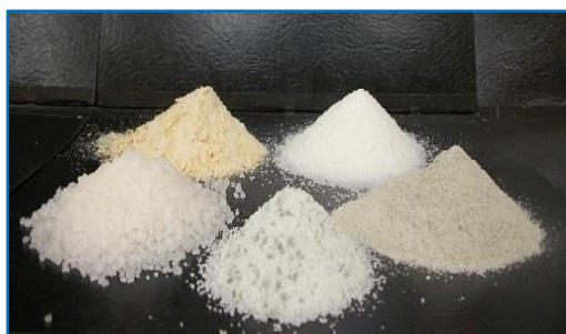
DIFFERENT BLENDS FOR DIFFERENT SOURCE MATERIAL