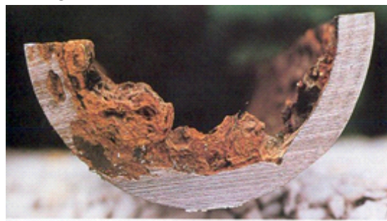
(Cross Section of a Damaged Pipe in a Closed Loop System; Damaged by Bacterial Activity)