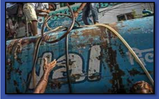
Illicit supplies during day time to the marginalized

Causation nine: Apathy and Complacency within the wealthy Arid Regions and within communities of previous plentiful water supply. They are being too slow to appreciate potable water being sacrosanct for the purpose to supply to kitchen and wash faucets and critical industries. In many communities their original water storage lakes and ponds have been forgotten,