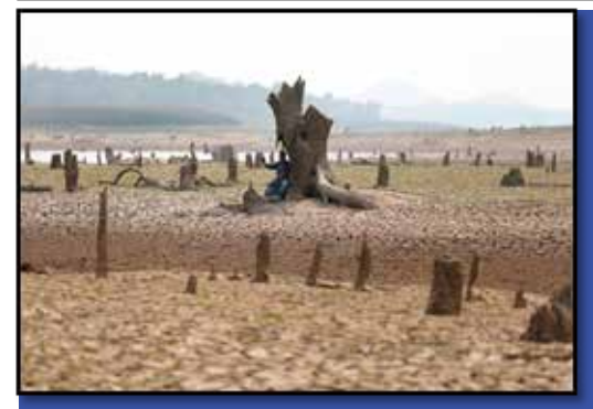
Mae Chang reservoir, Northern Thailand, March 2016