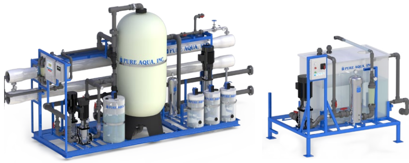
Brackish water reverse osmosis system

Pure Aqua supplies a full line of standard and fully customizable water treatment systems, all of which are engineered using advanced 3D computer modeling and process design software.