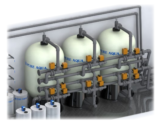
Pre-filtration with interconnecting piping, wiring and backwash pump