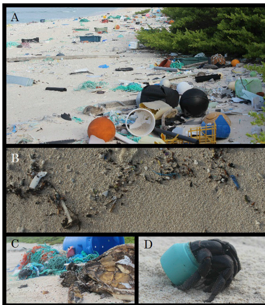
Fig. 3. (A) Plastic debris on East Beach of Henderson Island. Much of this debris originated from fishing-related activities or land-based sources in China, Japan, and Chile (Table S5). (B) Plastic items recorded in a daily accumulation transect along the high tide line of North Beach. (C) Adult female green turtle ( Chelonia mydas ) entangled in fishing line on North Beach. (D) One of many hundreds of purple hermit crabs ( Coenobita spinosa ) that make their homes in plastic containers washed up on North Beach.

Changes in the frequency of wildlife ingestion of or entanglement in debris are often used as an indicator of pollution in the