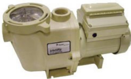
Pentair IntelliFlo and IntelliPro pumps