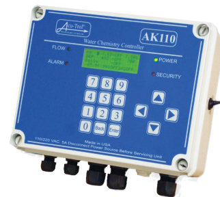
Pentair AK-100 chemical controllers

Headquarters 2842 Broadway Center Blvd., Brandon, FL 33510 941-371-0001 info@drive-chat.com