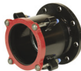
Flanged Coupling Adapters