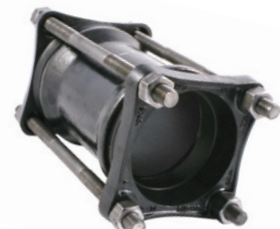
Mechanical Joint Couplings