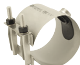
Stainless Steel Saddles