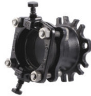
Restrained Flange Adapters