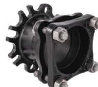
Flange Coupling Adapters