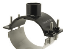
Fabricated Steel Saddles