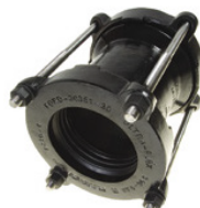
Ultra-Flex FC2W Couplings