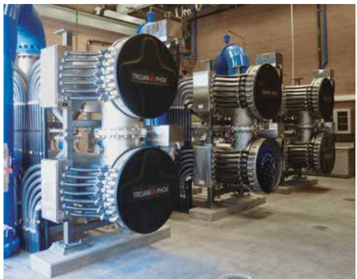
Figure 2. TrojanUVPhox™ system treating 1,4-dioxane

TrojanUV is part of the Trojan Technologies group of businesses.