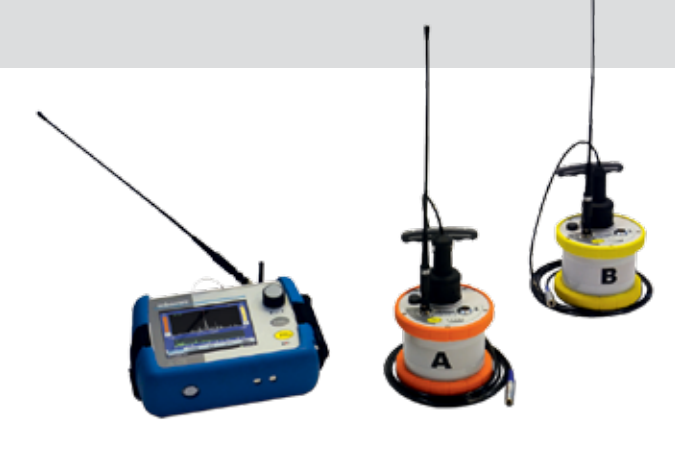
Power transmitters (transmitter and microphone)

However, if the measuring point is in an area which is difficult to access or if there is lots of interference, then you have the option to conduct a recorded measurement using the power transmitters or up to 8 multi-sensors. The multi-sensors are programmed accordingly with the correlator and then deployed. Following the measurement the power transmitters and multi-sensors are collected and the data can be read and evaluated by the correlator.