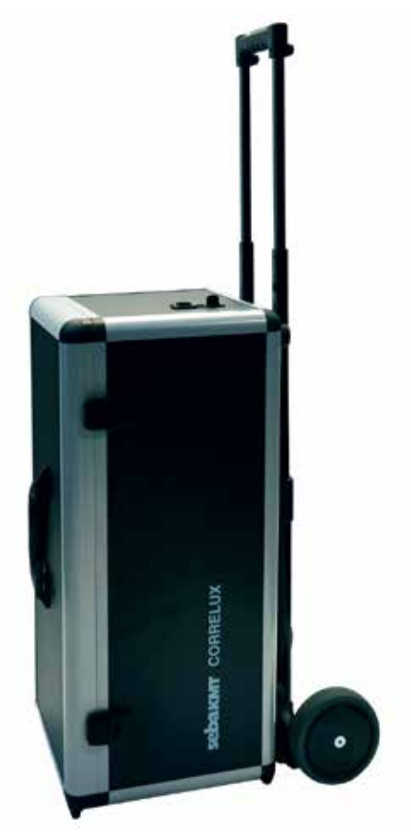
Transport case with induction loading and with optional wheel attachment

A wheel attachment is available for easy transport of the Correlux C-3. This can be retrofitted at any time without tools.