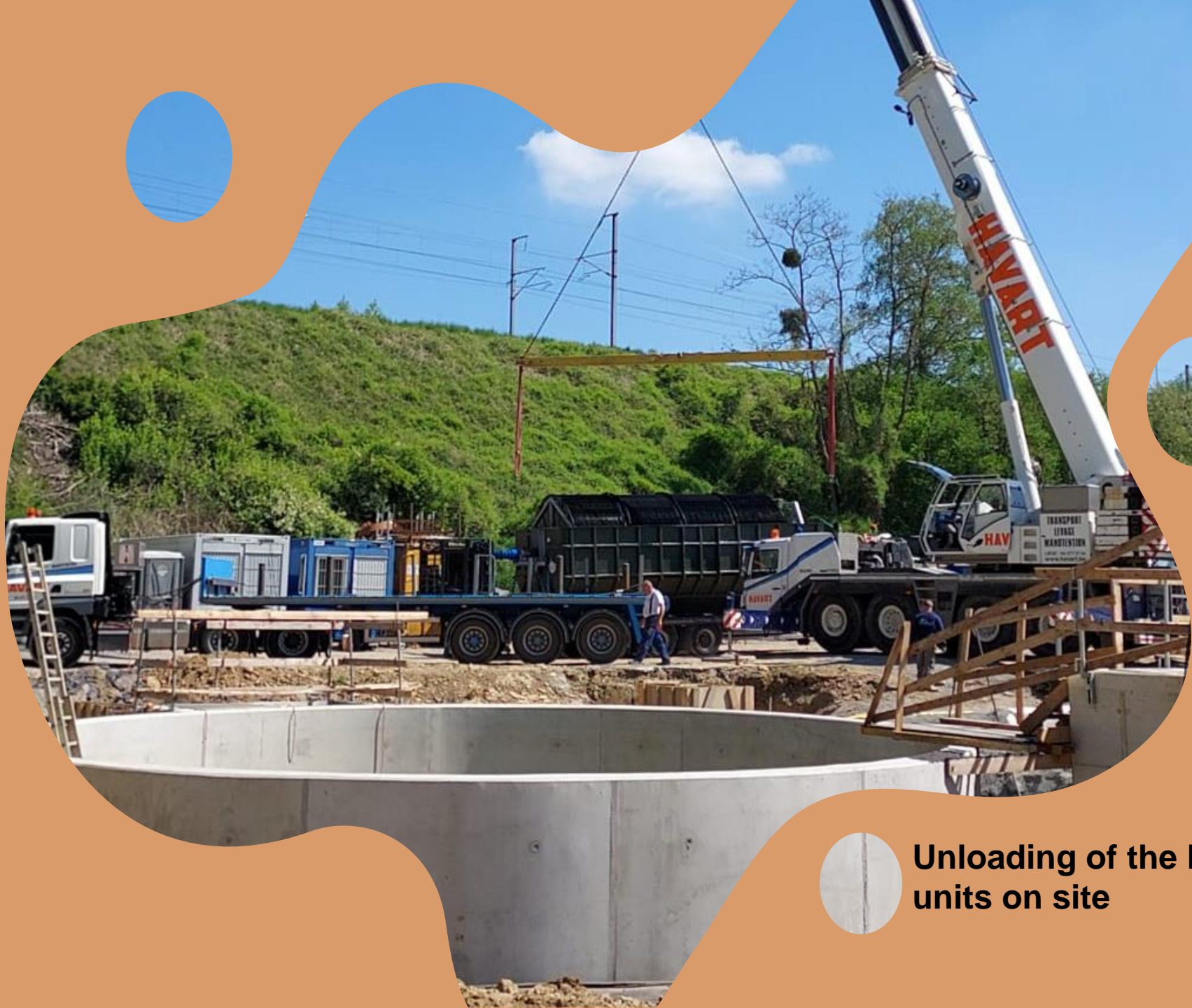
Unloading of the RBC units on site