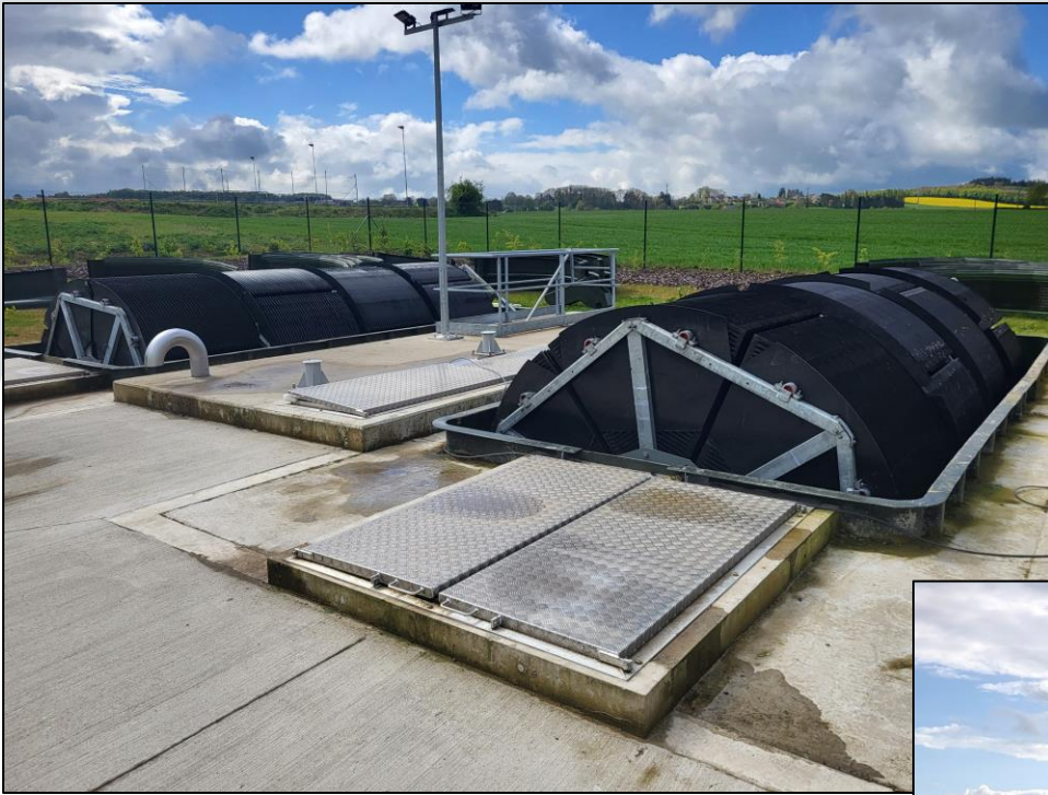
Units before and after the installation of the covers