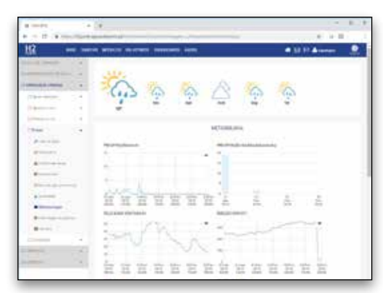
High-resolution weather forecasting was implemented to provide precipitation forecasts to the combined sewer system.

The main challenge in the implementation of the system was the city water cycle scale, which requires detailed resolution for many models and domains, including meteorology, water supply, sewer, and storm drainage. The city water scale also required the ability to consume large amounts of data from real-time sensors and consumers' telemetry and billing.