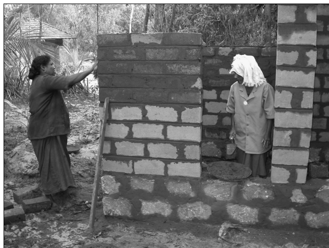
Figure 6. Women latrine builders

and their children. Nepal Water for Health 50 describe the case of a 34-year old Nepalese woman who was trained as a mason on a drinking water, hygiene education and sanitation project. Abandoned by her husband, she is the sole breadwinner for her two children and now works building latrine superstructures and foundations, installing pans and constructing slabs and rings. In spite of opposition from male masons reluctant to work alongside a woman, she is now a successful skilled mason and is able to provide for her children independently.