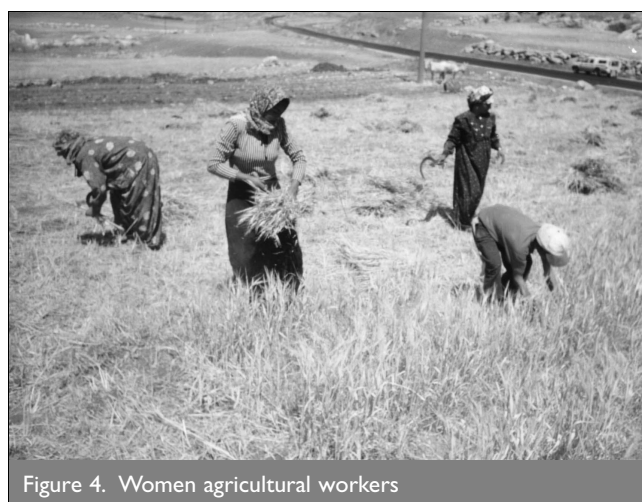
Figure 4. Women agricultural workers

Clearly, time saved in water carrying does not generally result in women being less productive. 12 Only the nature of the tasks change. However, there is evidence to suggest that quality of life may still be improved. Hoogervorst 41 demonstrates the impact of a Netherlands Development Organisation (SNV) programme in Benin, which constructs boreholes to provide safe drinking water. An evaluation noted that while women enjoyed time savings, they then increased