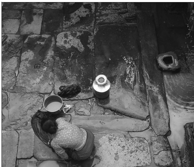
Figure 1. Woman collecting water at a well

physical or sexual assault in secluded areas. With the provision of appropriate toilets, women and girls can use them at any time, in private, without shame, embarrassment or fear. 7 This is a liberating development for women whose lives can often be dominated by this basic need.