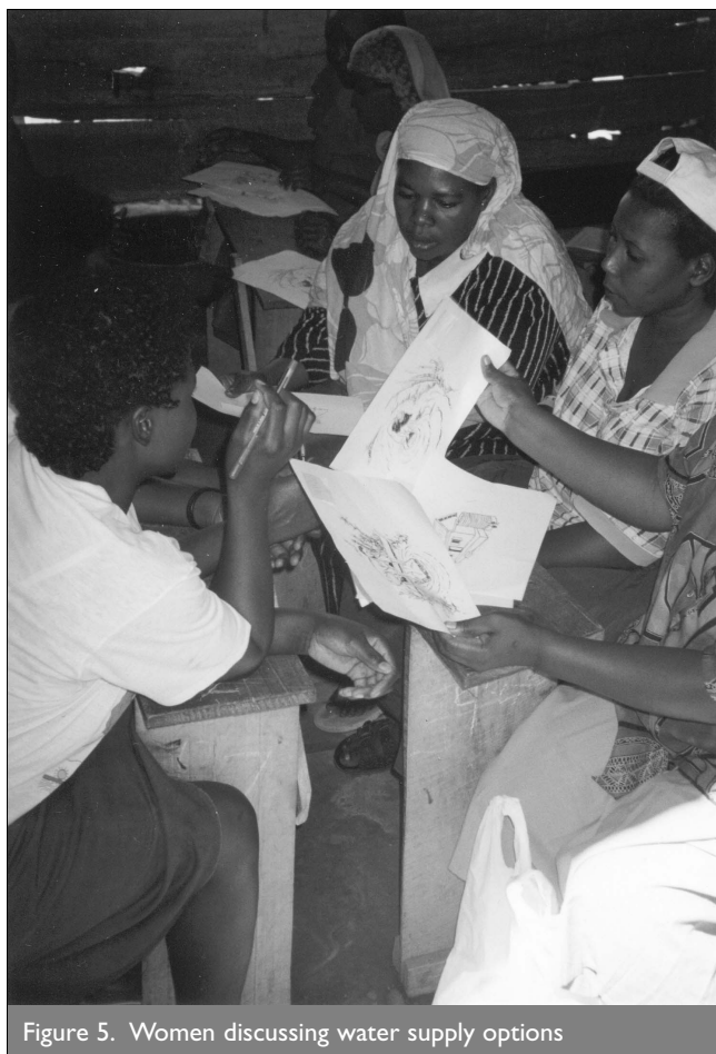
Figure 5. Women discussing water supply options

Three years ago, before we formed a committee and prepared ourselves as a community for the water source, men just saw women as animals. I think they thought of us as bats flapping around them. They had no respect and no one would allow you to speak or listen to what you had to say. When I stand up now in a group meeting I am not an animal. I am a woman with a valid opinion. We have been encouraged and trained and the whole community has learnt to understand us. I was treated like a donkey only fit to carry baggage all the time. Or a scrap of paper, just rubbish in the wind. I can assure you though, that if you come back in a few years you will see that women will be leaders of this village. That will bring so many benefits to everyone!