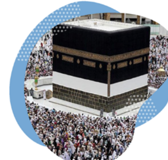
KINGDOM OF SAUDI ARABIA

More than 500 participants from the Arab Region and worldwide will have the opportunity to exchange the knowledge, new solutions and best practices with the international experts, companies and universities.