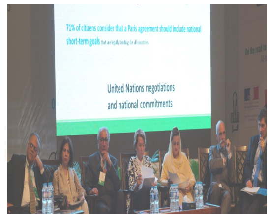
Eminent speakers during the two-day deliberations