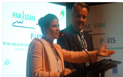
French embassy coordination team for Pakistan

The Lahore forum was jointly organized by the Embassy of France, Federal and Provincial governments, the United Nations, INGO's, NGO's WWF-Pakistan and large number of civil society organizations.