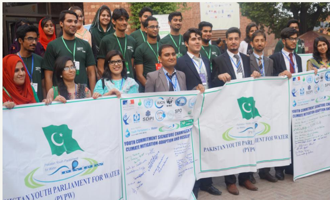
PYPW while Conducting Awareness Walk