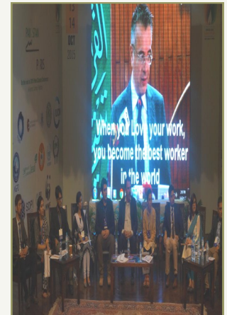
Youth while presenting declarations