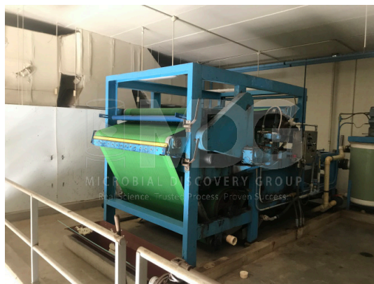
Figure 4. Sludge pressing equipment