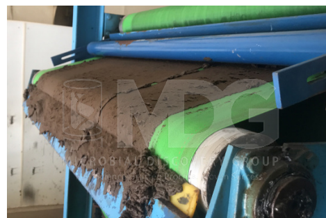
Figure 1. Sludge pressing equipment