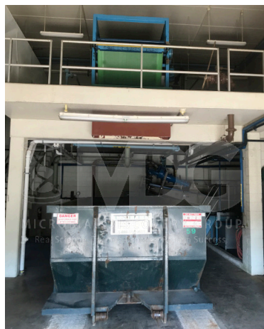
Figure 3. WWTP equipment