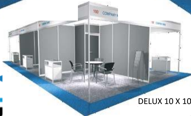
DELUX 10 X 10 M