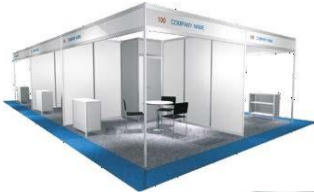
STANDAR 5 X 5 M