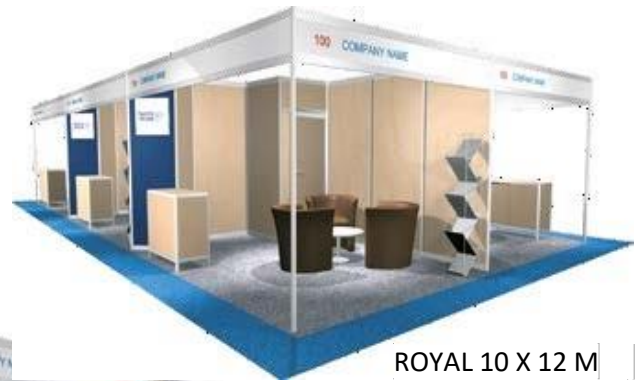
ROYAL 10 X 12 M