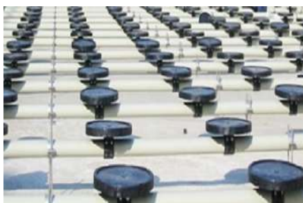
DIFFUSERS (COARSE) (EPDM/SILICON)