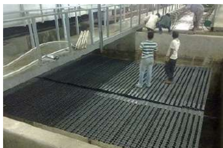
TUBE DECK MEDIA