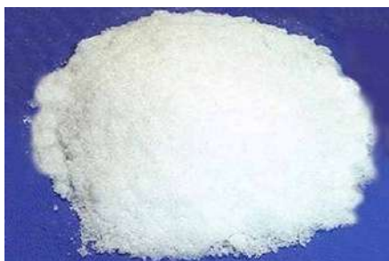
CHEMICALS (LIME, ALUM, POLY, CHLORINE)