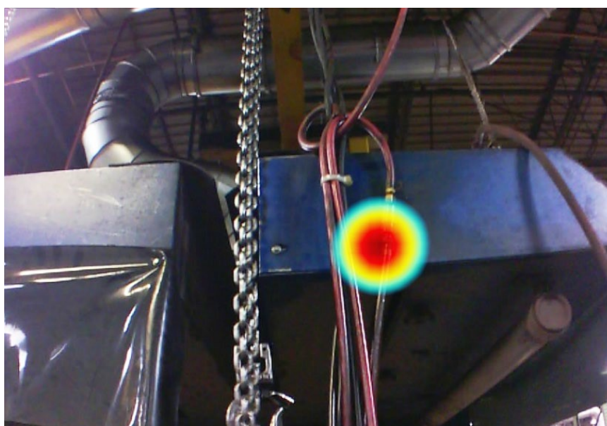
Images taken with the ii900 Sonic Industrial Imager in an industrial environment.

Fluke. Keeping your world up and running.®