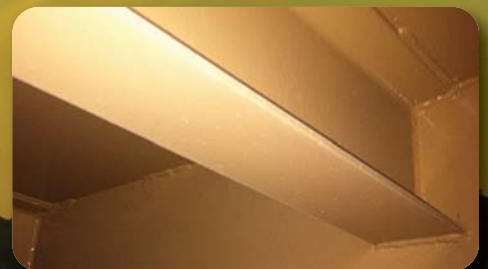
Superior I-beam construction

Innovation, quality workmanship, extreme durability and dependability define our storage buildings and are the answer to your hazardous material storage needs.