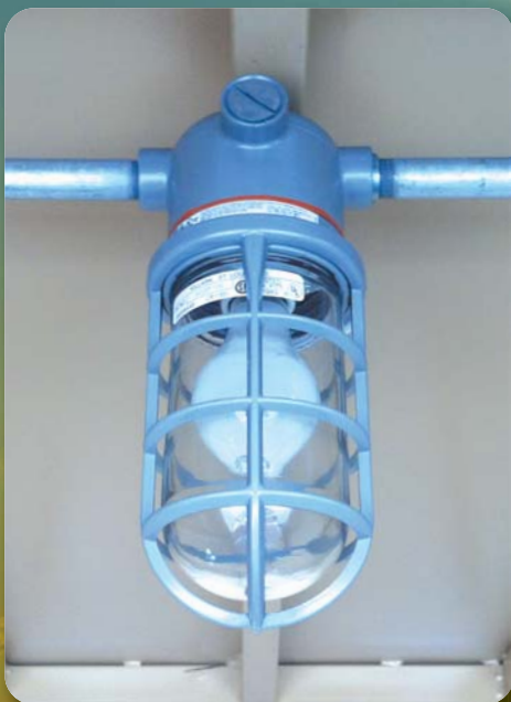
Explosion proof lighting