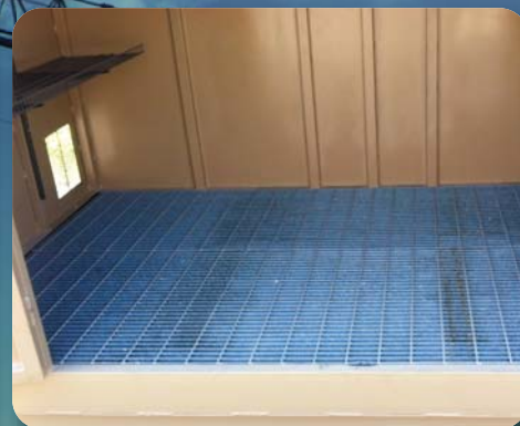
Galvanized steel grating over secondary containment sump