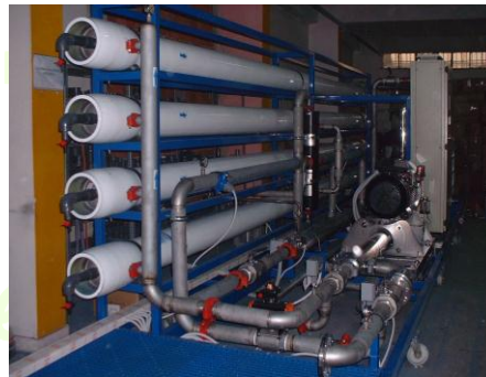
Bodrum – 360 m3/d Sea Water Reverse Osmosis System

200 m3/d Sea Water Reverse Osmosis System