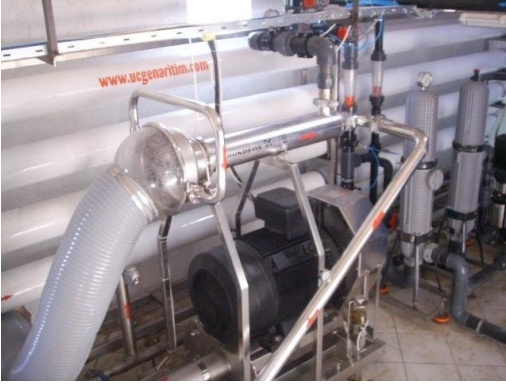
Club Blue Dreams Otel

350 m3/d Sea Water Reverse Osmosis System