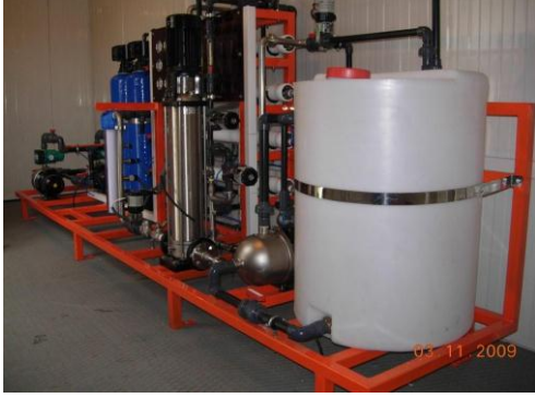
Global Tawreed – Kuwait

24 m 3 /day Container Type Sea Water Reverse Osmosis System