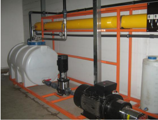
TECHNOLOGIES Sema İçkileri – Cyprus

100 m 3 /day Sea Water Reverse Osmosis System