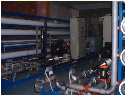
Can Cun - Mexico

200 m3/d Sea Water Reverse Osmosis System